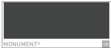
ALUMINIUM FACIA AND GUTTER DULUX- POWDERCOAT MONUMENT