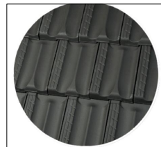
ROOF TILE: MONIER- MARSELLIE MYSTIC GREY